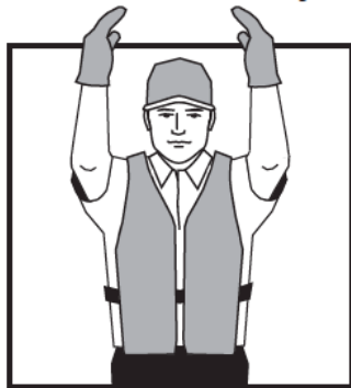
Come straight back.