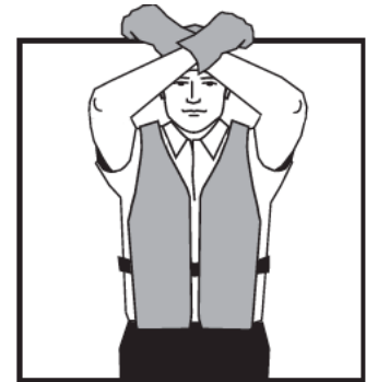
Closed forearms indicate STOP.